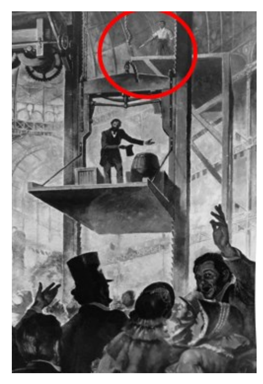
Cutting the ROPE