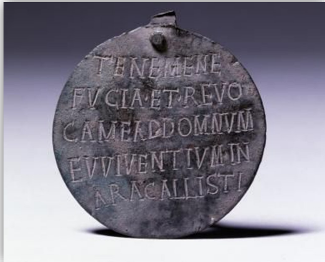
“Hold me, lest I flee, and return me to my master.”